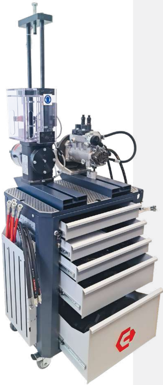
Carbon Zapp Trolley Fully Configured Setup