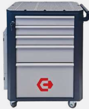
/// CZ Base Trolley