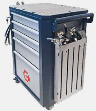
/// Hose & Harness Side Organizer (max. 2 pcs per trolley)