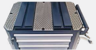
/// Cambox/Pump Transfer Rack (max. 2 pcs per trolley)