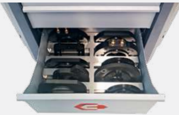
/// CRp Flange Drawer Organizer (max. 1 pc per trolley)

Ideal workshop organizer to fit most parts of the machine like harnesses, hoses, adapters, tools and flanges. Can be easily transformed to a Cambox and/or pump rack for easy transfer and storing.