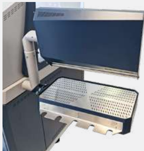
01. Desk & Harness Shelf