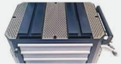
/// Cambox/Pump Transfer Rack (max. 2 pcs per trolley)