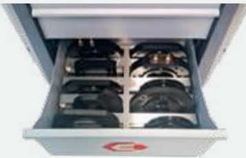
/// CRp Flange Drawer Organizer (max. 1 pc per trolley)

Ideal workshop organizer to fit most parts of the machine like harnesses, hoses, adapters, tools and flanges. Can be easily transformed to a Cambox and/or pump rack for easy transfer and storing.