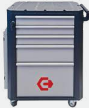
/// CZ Base Trolley