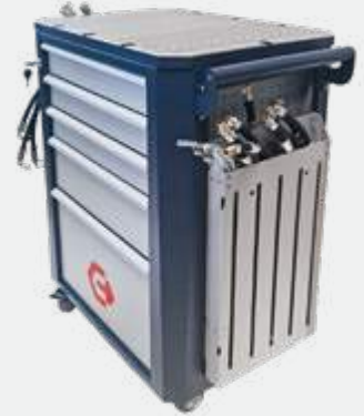
/// Hose & Harness Side Organizer (max. 2 pcs per trolley)