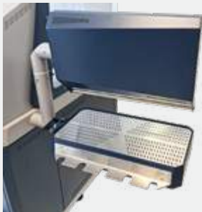
01. Desk & Harness Shelf