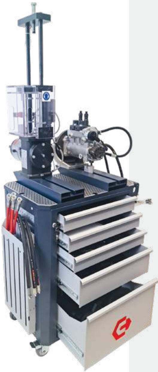
Carbon Zapp Trolley Fully Configured Setup