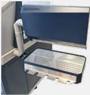
01. Desk & Harness Shelf