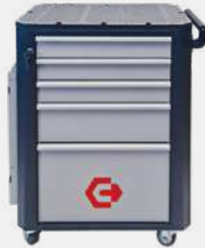
/// CZ Base Trolley